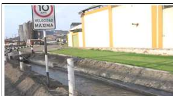
Figure 1. Initial Sample

In this step, the sample point was identified from the waste effluent that is discharged directly to the sea. The polyethylene recipients with volume of 1L of sample were used for Total Suspended Solids and recipients with volume of 200 mL of sample were used for COD. Then recipients were labeled and subsequently placed in a cooler.