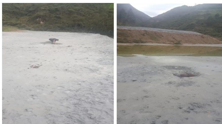
Figure 1. Sampling of Relavera Sayapullo's tailings

The original gold tailings are from the district of Sayapullo, department of La Libertad, the sample corresponds to 200 kilos of tailings that was sampled by carrying out 04 test pits with an area of 1 m 2 and a depth of 1 m, this sample was transferred to a laboratory where it was dried at 105 °C for 24 hours in a Schemin oven, then the entire sample was homogenized by the cone method using a shovel, followed by cracking using a Jones cracker, until representative samples were obtained for the metallurgical tests and trials.